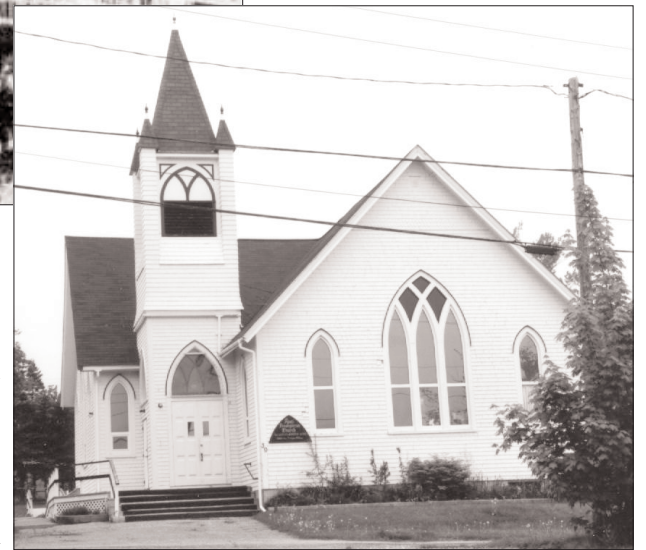
Third Knox Church on Grant Street.