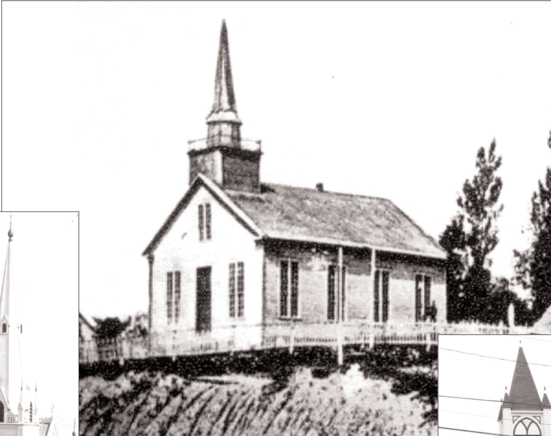
Second Knox Church on Baddeck Bay Road.

The first Presbyterian church erected in Baddeck was located just east of the village on the Baddeck Bay Road and was named Knox. It was built in 1841 and was more than likely a log structure. By 1857, the original church had been replaced on the same site by a larger wooden frame building - it still bore the