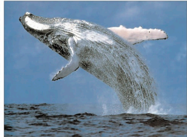
Humpback Whales are also found in the waters off Victoria County - one of the more dramatic to see.

These mammals have long been hunted for their valuable meat as well as their fat or oil, their baleen plates and even the ambergris of the Sperm