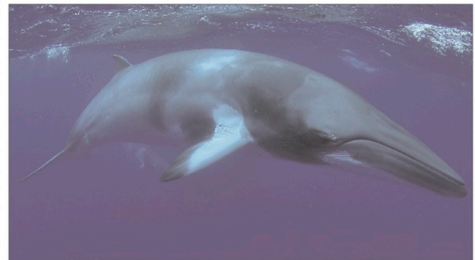
A Minke Whale, one of the many Whale species to be found in the waters off Victoria County.

Whale (used in the production of perfume). Whaling, particularly before regulations were passed in many places in the world, ensured that some species were almost completely decimated. In the 1900's alone, over 2 million whales were slaughtered.