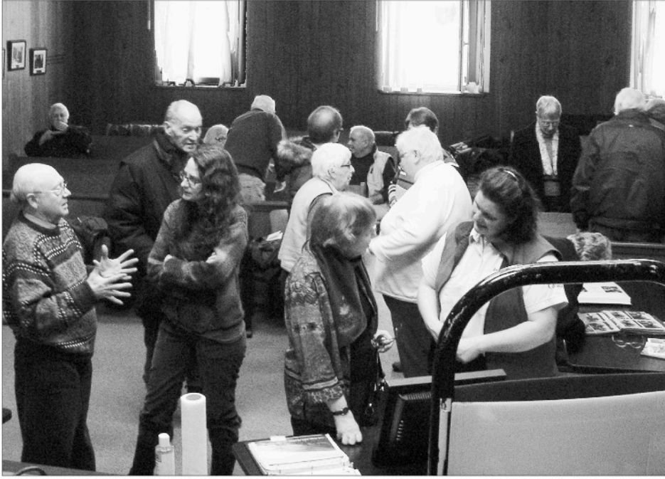
In the photo are just a few of the 45, or so, who visited the Victoria County Heritage and Archives during the annual Heritage Day.