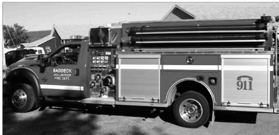
This is the Department's new Specialty Emergency Operations Mini Pumper.

Department does not come cheap. The bare annual operating costs are approximately