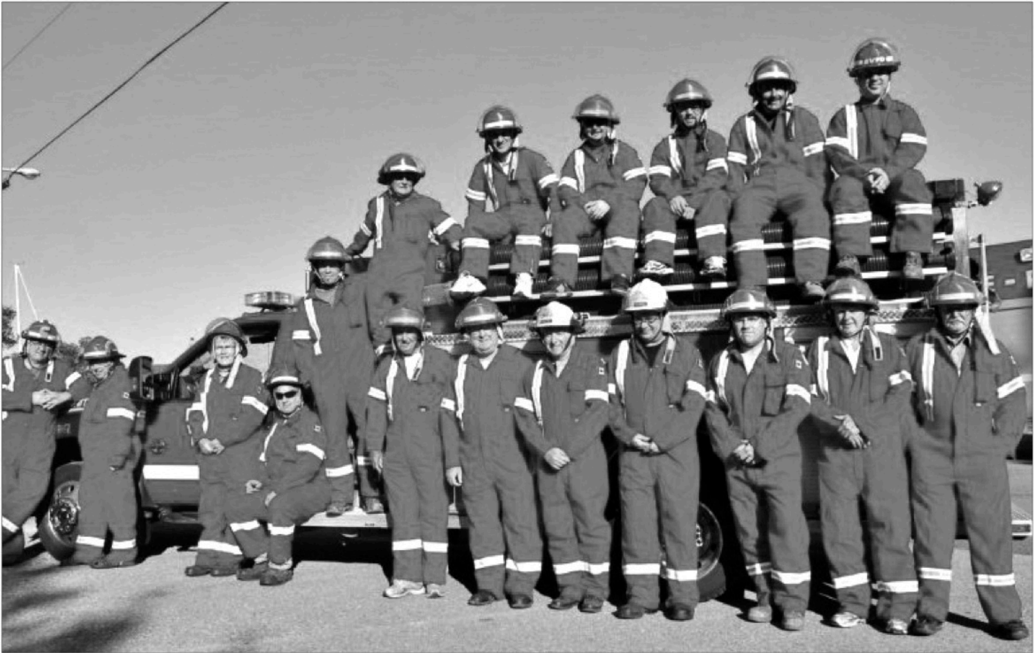
Pictured are 18 Firefighters who turned out recently for a special "photo op".

A book entitled Sparks and Volunteers by Mac Fuller makes for excellent reading and is an informative and sometimes humorous history, up to the turn of the Century, of your BVFD. Copies are available at The Blue Heron Gift Shop.