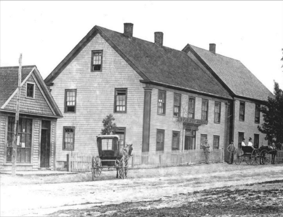
The Old Bras d’Or House