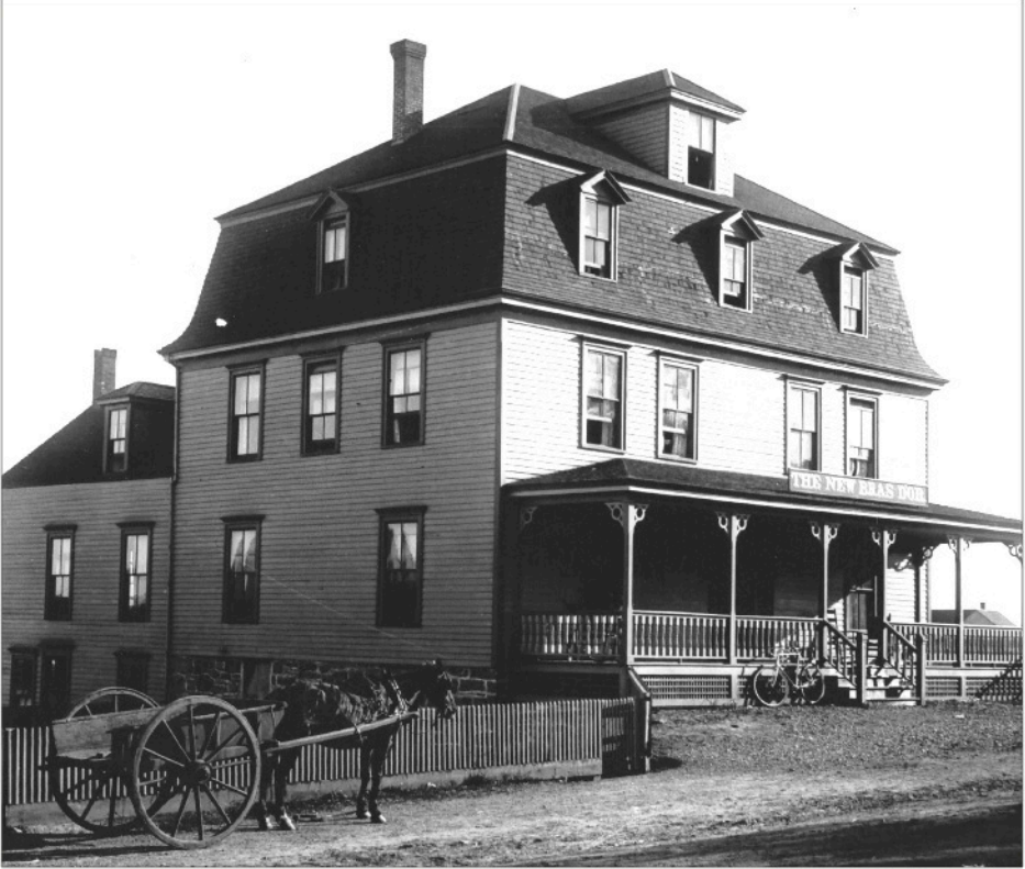
The New Bras d’Or House

Both of these hotels depicted in the photographs were (are) situated on the