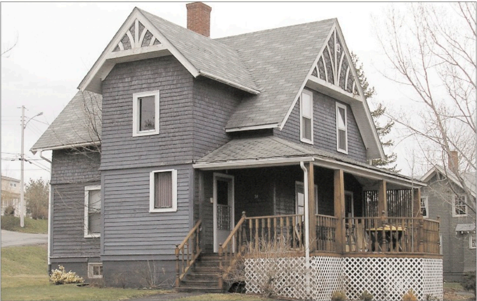
Noel/MacRae House - Baddeck