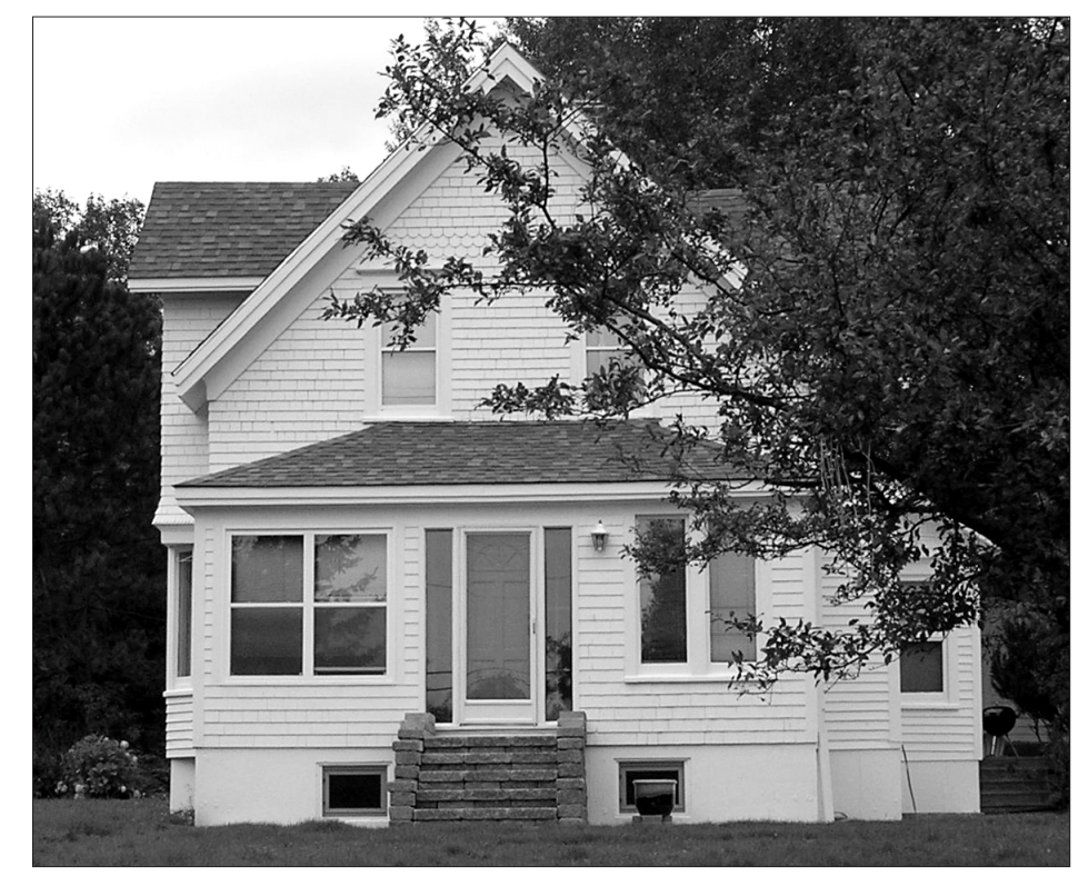
J.P. MacLeod House, then and now.