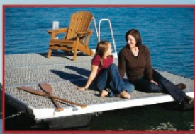
NEW ThruFlow™ Decking & Docks