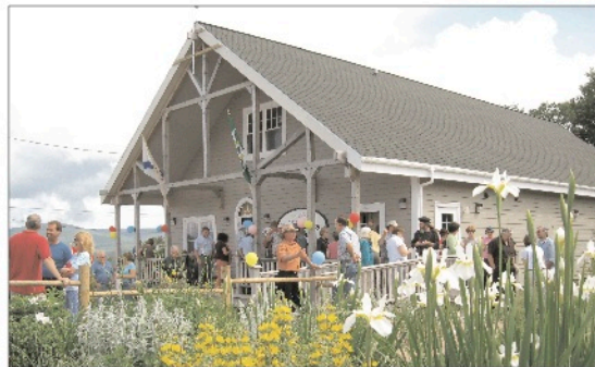
North Highlands Community Museum and Culture Centre on a bright sunny day.

In the past several years, with financial support from all three levels of government,