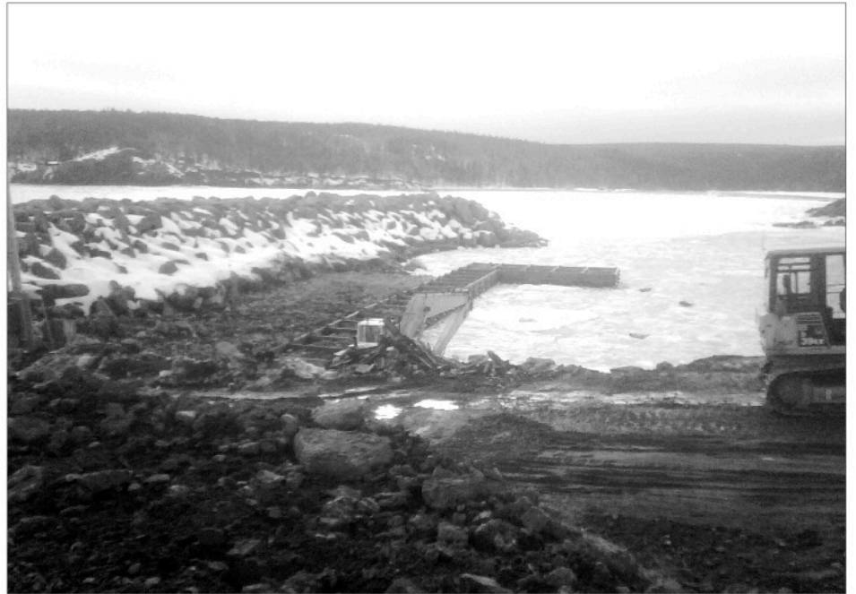
Construction on the new wharf in Neil's Harbour is proceeding on schedule. In-filling of the extensive crib work will be completed by March 31st/11. The concrete deck of the new wharf cannot be poured now due to weight restrictions on the Cabot Trail, but is expected to be poured in early May.