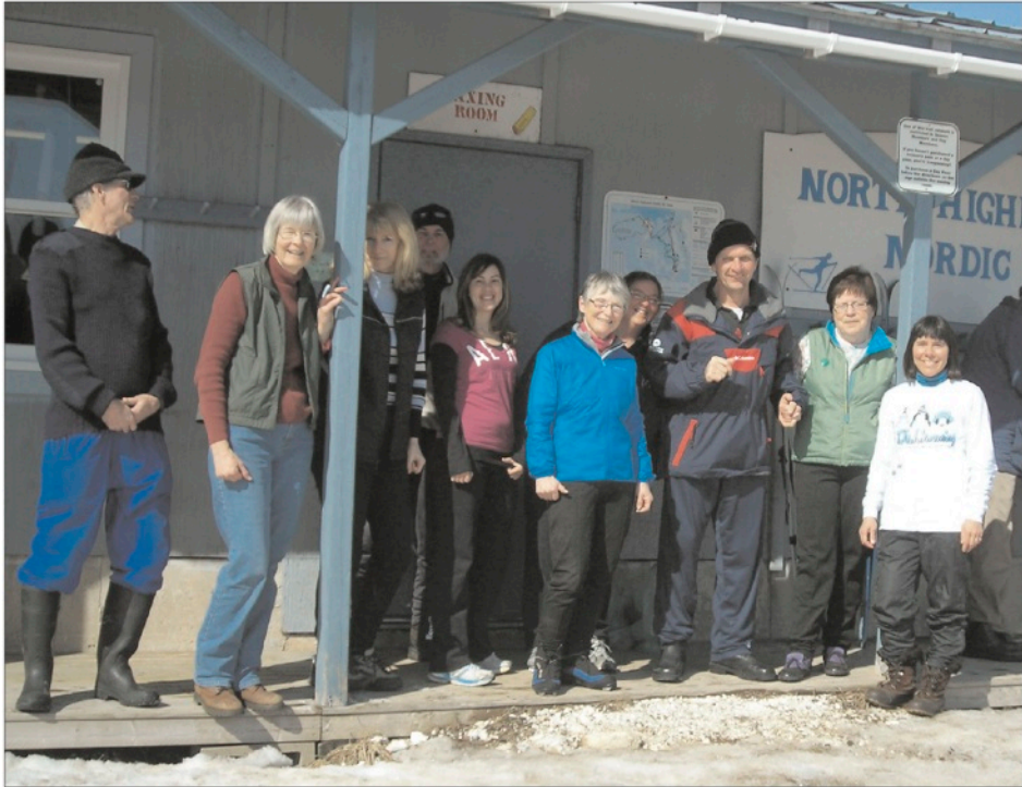
Pictured are some of the participants in "Snowmen & Women" enjoying the Tuesday social ski/snowshoe lunch at North Highlands Nordic this past winter. Funding for this program was generously provided through the Nova Scotia Department of Seniors Positive Aging Fund.