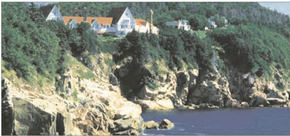
The spectacular setting of the Keltic Lodge and Spa on Middle Head.

from page one manages the adjacent Highland Links Golf Course, the top ranked public golf course in Canada.