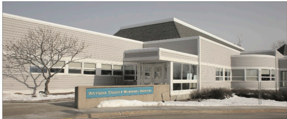
Victoria County Memorial Hospital in Baddeck is the subject of an emergency care review by the Cape Breton District Health Authority and the N.S. Department of Health.