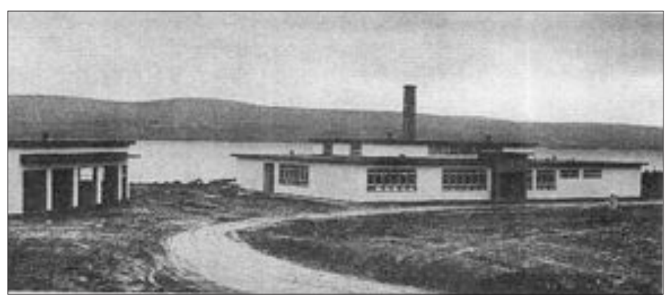
Baddeck Rural High School

Designed to accommodate approximately two hundred students, it incorporated facilities for a broad and inclusive high school curriculum. It contained five academic classrooms, one of which doubled as the science laboratory. The auditorium/gymnasi-