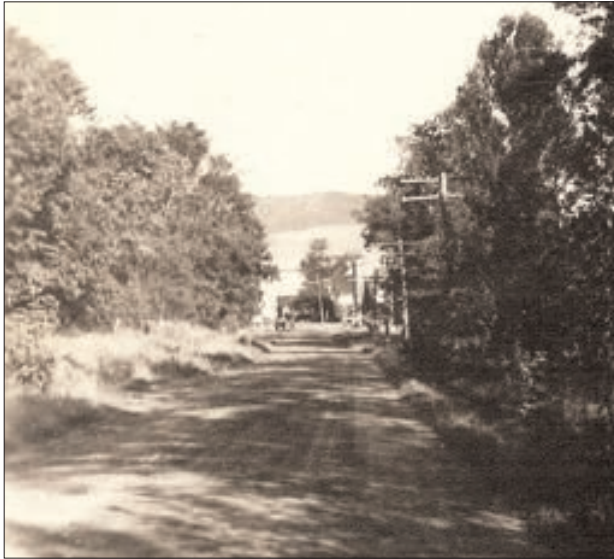
Looking east, down the old Margaree Road toward Bethune's Corner sometime in the 1930s.

Do any of these businesses bring back memories for you? Why not drop into the next meeting of the Baddeck & Area Historical Society meeting, April 21st at 4 p.m. in the courtroom at the courthouse. We'd love to see you and hear your memories of people, places and events from Victoria County's past.