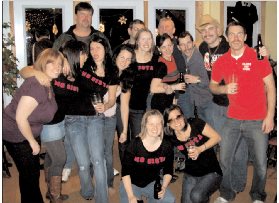
Movember's Team Baddeck, 2009.