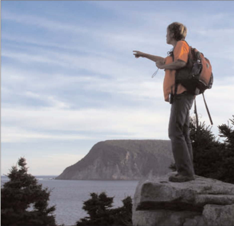
All manner of vistas greet the Hike the Highlands hikers.

encourage to take photos and enter the photo contest. Hike the Highlands Festival is very fortunate to have Wally Hayes, a professional photographer, lead and instruct the Nature & Landscape Photography workshops on September 10 & 11th. The Nature and Landscape workshops will emphasize choosing a subject; composition and lighting; using people effectively in pictures; choosing lenses and apertures to control perspective, subject motion and depth of field. Evening presentations are also popular with hikers and some of this year’s line-up includes Hikers Safety by Erich Muntz, CBHNP; West Highland Way in Scotland by Andrew Powter; hiking