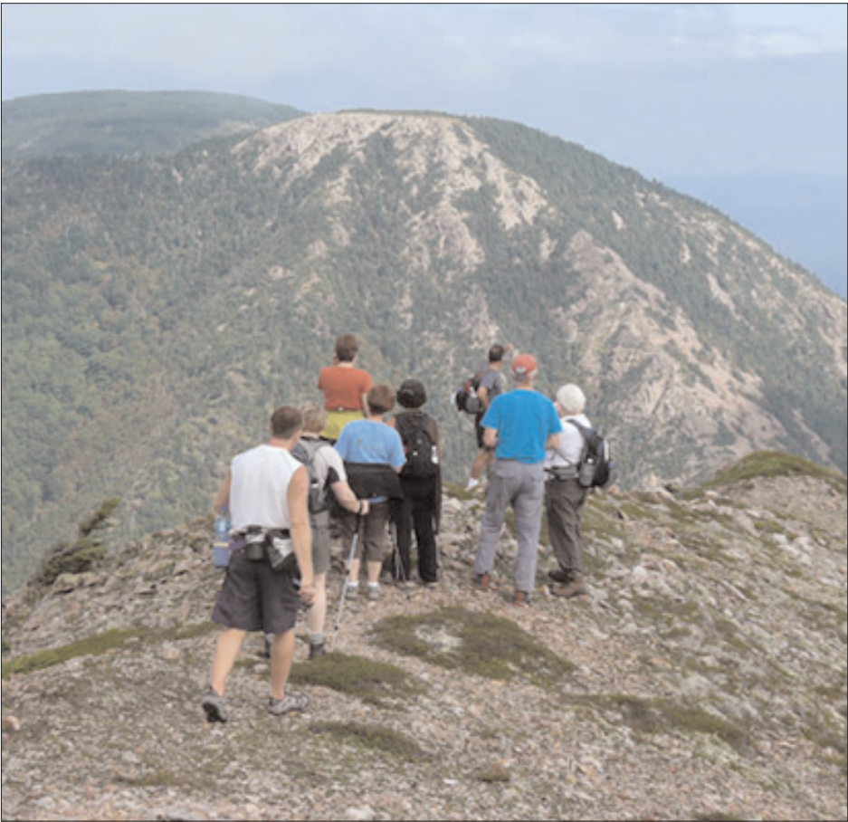
This group reached their destination at Money Point.