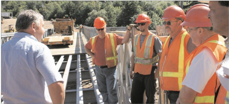
Premier Dexter thanks workers at Salmon River Bridge for their efforts